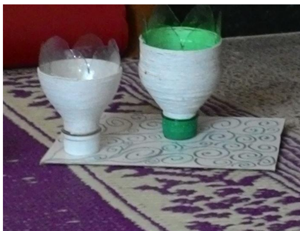
BOTTLE PLANT POT – 2016

Mother Teresa Women's University Research and Extension centre Coimbatore, Department of Home science–Fashion Designing and Garment Construction students organized club activities on Designing cloth file on 27 January, 2017. The purpose of this activity is to make students of the department to learn the procedure to produce cloth file. Finally the cloth file can be enriched by doing embroidery or Fabric painting. With some paints and a brush, you can conjure up beautiful designs, textures and patterns on the fabric initially before the construction of cloth file. Completely transform it into a work of art.