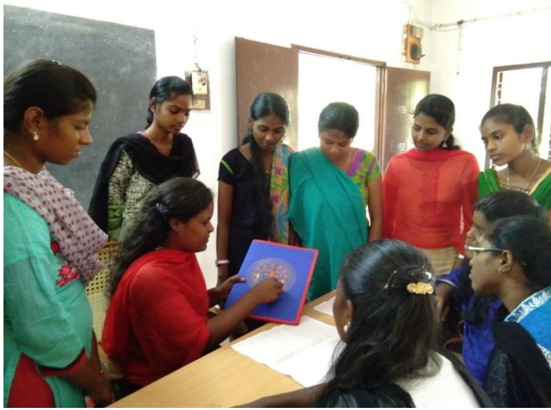
Designing Cloth file -2017

Mother Teresa Women's University Research and Extension centre Coimbatore, Department of Home science-Fashion Designing and Garment Construction students organized club activities on Hand printing techniques on 24 February, 2017. Hand printing is a fast and easy way to put your personal "stamp" on almost anything in your life. In these activities students get more knowledge about printing Techniques and displayed their final products.