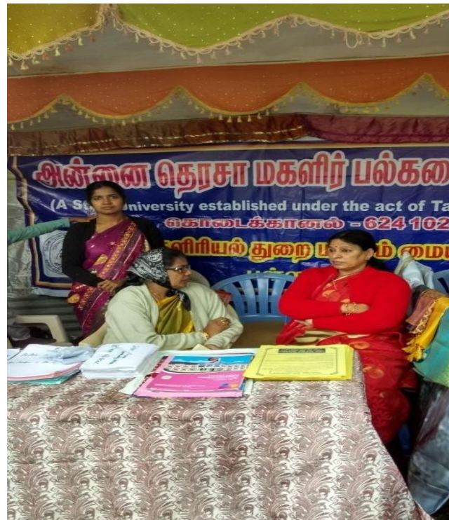
Pongal Celebration on 13.01.2017 at MTWU, Research and Extension Center, Pallapatti

The 56 th Flower Show was organized at Kodaikanal in May 2017, conducted by the Department of Horticulture kodaikanal. From Mother Teresa Women's University, individual stall has been arranged to popularise the University